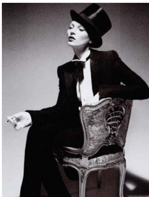
Kate Moss posing as Marlene Dietrich in the September issue of "Vanity Fair"