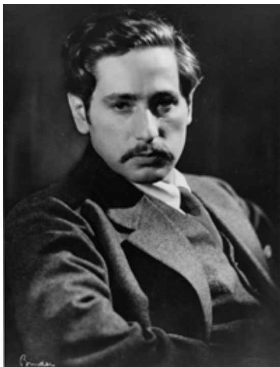
Portrait of the young Josef von Sternberg by Lotte Eckener done for Atelier Binder in 1929

In occasion of the centenary of photographer Lotte Eckener the Projektgruppe Fotografie am Bodensee shows „Lotte Eckener. Photographien von 1925 – 1965“ At Kulturzentrum am Münster in Konstanz, February 9 – March 26 2006; opening hours every day except Monday 10 – 6, on Saturdays and Sundays 10 – 5.