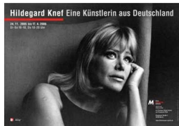
Exhibition Poster Same photograph is on the book cover