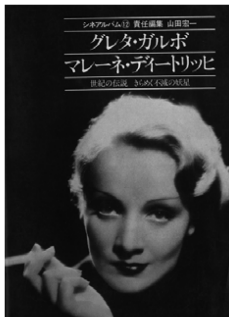
Koichi Yamada Greta Garbo/ Marlene Dietrich – Legends of the Century – Immortal Stars Tokyo: Hagar Shoten 1972