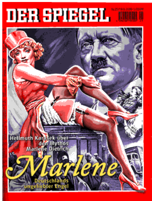
Cover DER SPIEGEL issue 25/2000 from June 19th